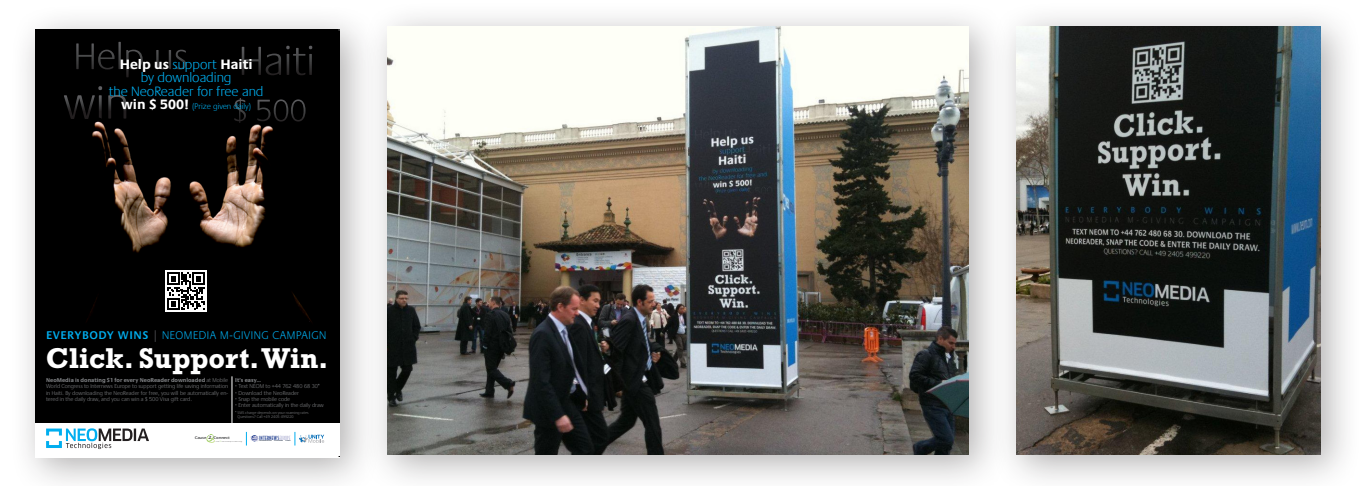
Figure 1.9. Test and test again

Consumers will be deterred from using mobile barcodes if they initially have an unsatisfactory experience. So-called 'dead links', where scanning a mobile barcode does not return any information or mobile barcodes which link to the wrong URL and the wrong information, can be damaging, not only to a given campaign, but to the brand and the adoption of mobile barcode marketing in general. In order to avoid this, every implementation of a mobile barcode should be tested to ensure correct resolution address, and ability to scan using a variety of mobile barcode scanner applications running on a number of different camera equipped mobile devices.