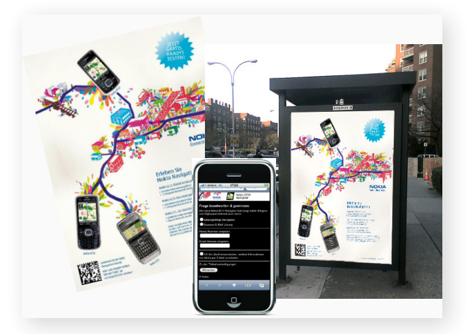
Figure 1.1. Plan ahead

Mobile barcodes should be an integral part of any mobile marketing campaign. Ensure that mobile barcodes are incorporated into digital and traditional media as a key element of the campaign. This will help to ensure that interactivity is an essential element of the campaign itself and not simply an afterthought.