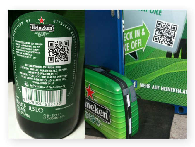
Figure 1.3. Design and Placement