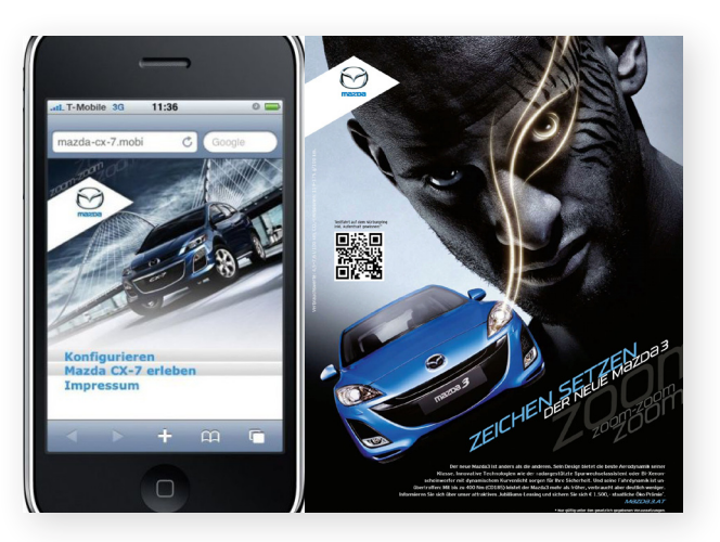
Figure 1.8. Optimize for mobile

These elements make it critical for brands to deliver a customized mobile experience to the