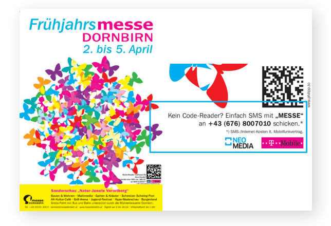
Figure 1.7. Education

Consumers are willing to adopt new technologies but marketers must deploy these technologies in a manner that makes them understandable and easy to use. Since mobile codes are new to the mass market, this means that brands are encouraged to place descriptive copy next to a mobile code in order to explain what the mobile code is, what it does and what value it provides after the scan. This simple educational element will help to facilitate and encourage consumer participation.