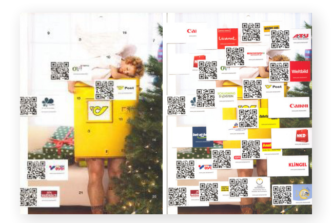
Figure 1.2. Design with your consumer in mind

Consumers generally only opt in to receive communications from brands when they perceive that it will be relevant or deliver value to them, by means of giveaways, discounts, information or services based on entertainment and utility. Access to relevant content can help grab the consumer's attention and encourage interaction. By delivering value and relevance in your integration of mobile barcodes, you can increase your consumer base and promote consumer participation in your campaign, thus bringing value to the consumer in a form suitable for both your brand and campaign.